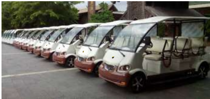
Scenic Spot of Hainan, China