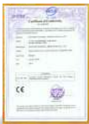
CE Certificate for Sightseeing Vehicle