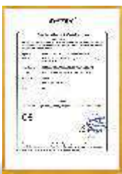
CE Certificate for Golf Car