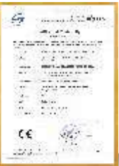
CE Certificate for Hunting Car & Utility Vehicle