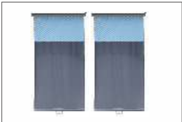
Side Sunshade Curtain For DN-11