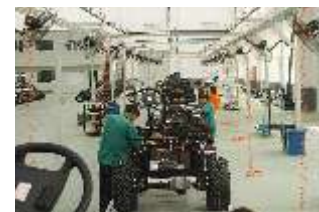
Automatic Production Line