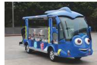
DN-14F Dolly Fish