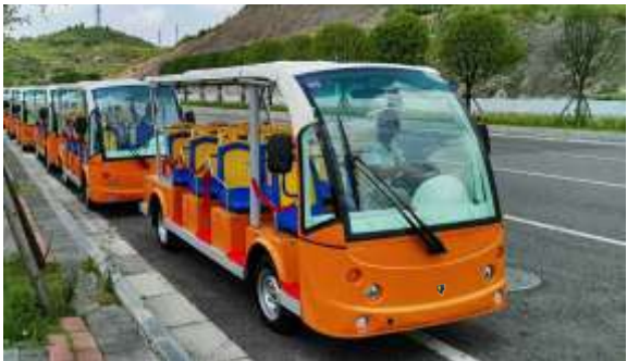
Scenic Spot of Hubei, China