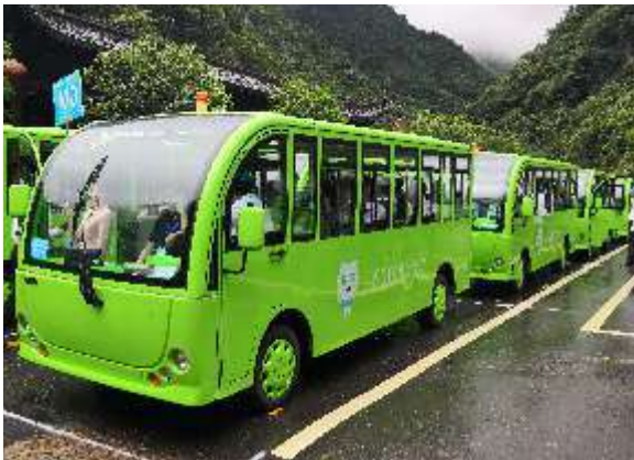
Scenic Spot of Jiangxi, China