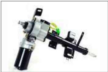
Power-assisted steering system