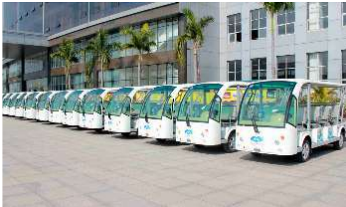
Scenic Spot of Huizhou, China