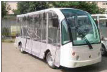
Weather Enclosure For DN-14