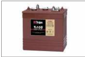
Trojan Battery (from USA)