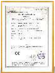
CE Certificate for Mobility Scooter