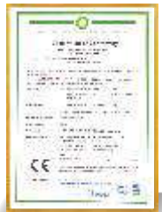
CE Certificate for Mobility Scooter