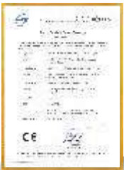
CE Certificate for Electric Scooter

Due to the advanced imported facilities and professional R&D teams with over 100 experienced engineers, Marshall is determined to build a responsible and reliable enterprise by offering top quality new products and best services to our customers in every corner of the world.