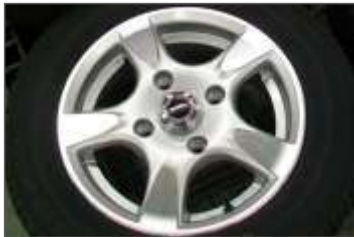
Aluminium Rim For DN-14