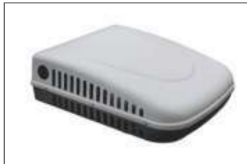
Vehicle Mounted Air Conditioning