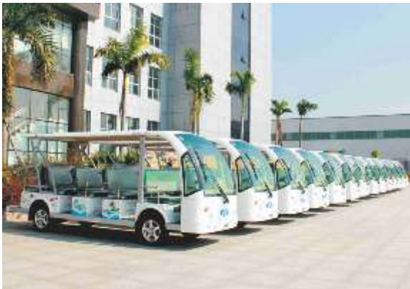
Hong Kong-Zhuhai-Macao Bridge Project