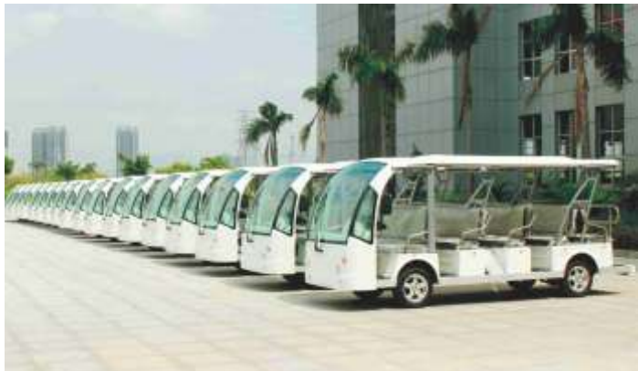
Military World Games